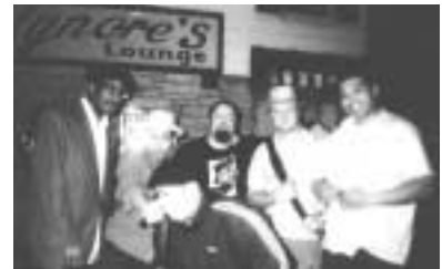
right: p.i.c, the group responsible for the controversial move to bring the highly infectious hiphopunkfunkmamboska sound across national borders